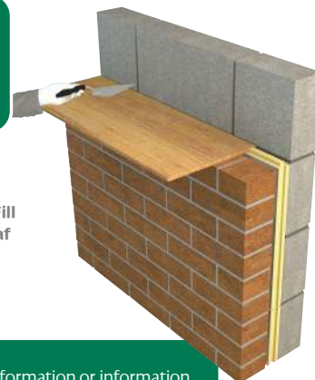
Figure 2 - Use of Eco-Cavity Full Fill when installing the inner wall leaf

To access pre-existing product information or information relating to previously sold/discontinued products please email marketing@ecotherm.co.uk .