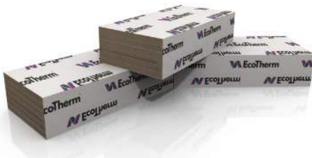
Table 1 Eco-Cavity Full Fill typical weights, thermal resistances & U-values