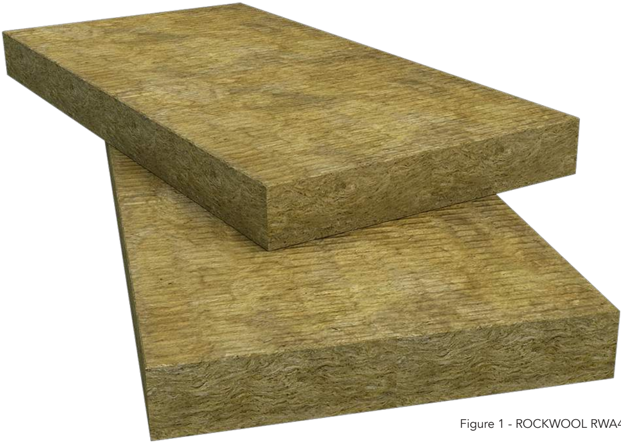
Figure 1 - ROCKWOOL RWA45